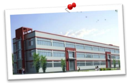
Kitex Littlewear Limited Sewing production unit

In line with our total Capex plan, we have formed the following wholly owned subsidiaries for which Incorporation certificate has been received.