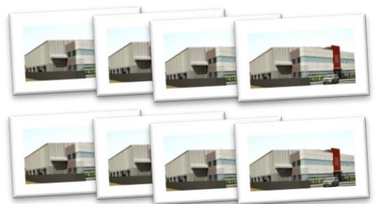
Kitex Babywear Limited Mothers' sewing units