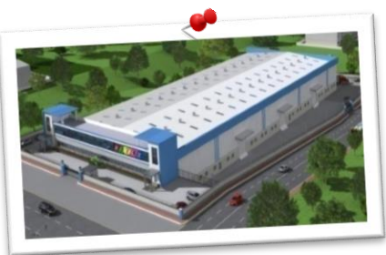
Kitex Socks Limited Socks manufacturing facility